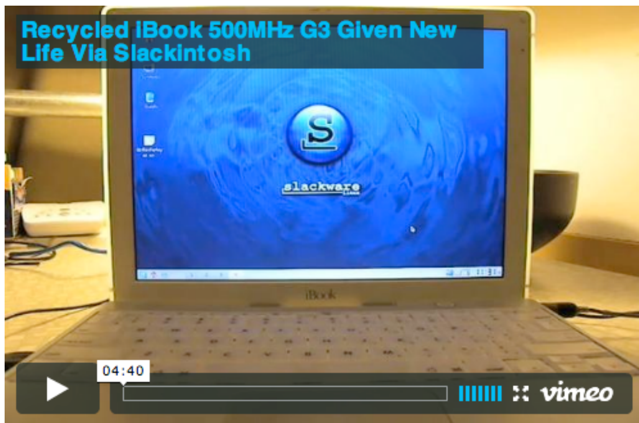
Recycled iBook 500MHz G3 Given New Life via Slackintosh— recycled iBook, slackintosh open source operating system (ecoarttech, 2010)