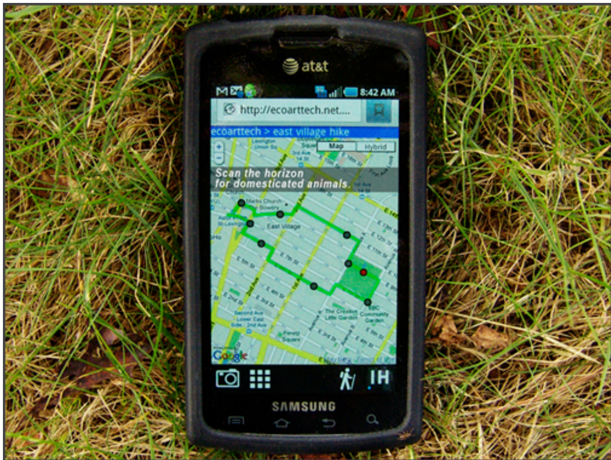
Indeterminate Hikes—Custom Android app for urban hiking ( ecoarttech , 2010)

art can create a “habitable” space within dizzyingly new experiences, a space hospitable to human-animal creativity. Or perhaps, always, eco-art performs both at the same time. Eco-art is displaced continuity and continuous dis-location. It is responsive resistance and resistant response. It is homelessness, or restlessness, at home with itself. It is neither truly nostalgic, nor inherently progressive. When Arthur and Marilouise Kroker define “critical digital studies,” they articulate this sentiment without reference to homemaking or eco-art: “There is a desperate requirement to do something that is as ancient as it is futurist: to find the ‘words’ by which to make familiar to our senses the new home of digital technologies within which we have staked our identities” (Kroker & Kroker, 2008, pp. 7-8).