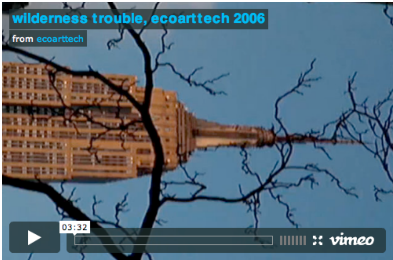
Wilderness Trouble—digital video (ecoarttech, 2006)