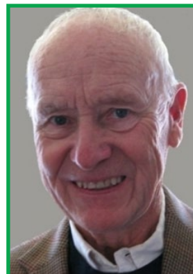
Leading orality-literacy scholar